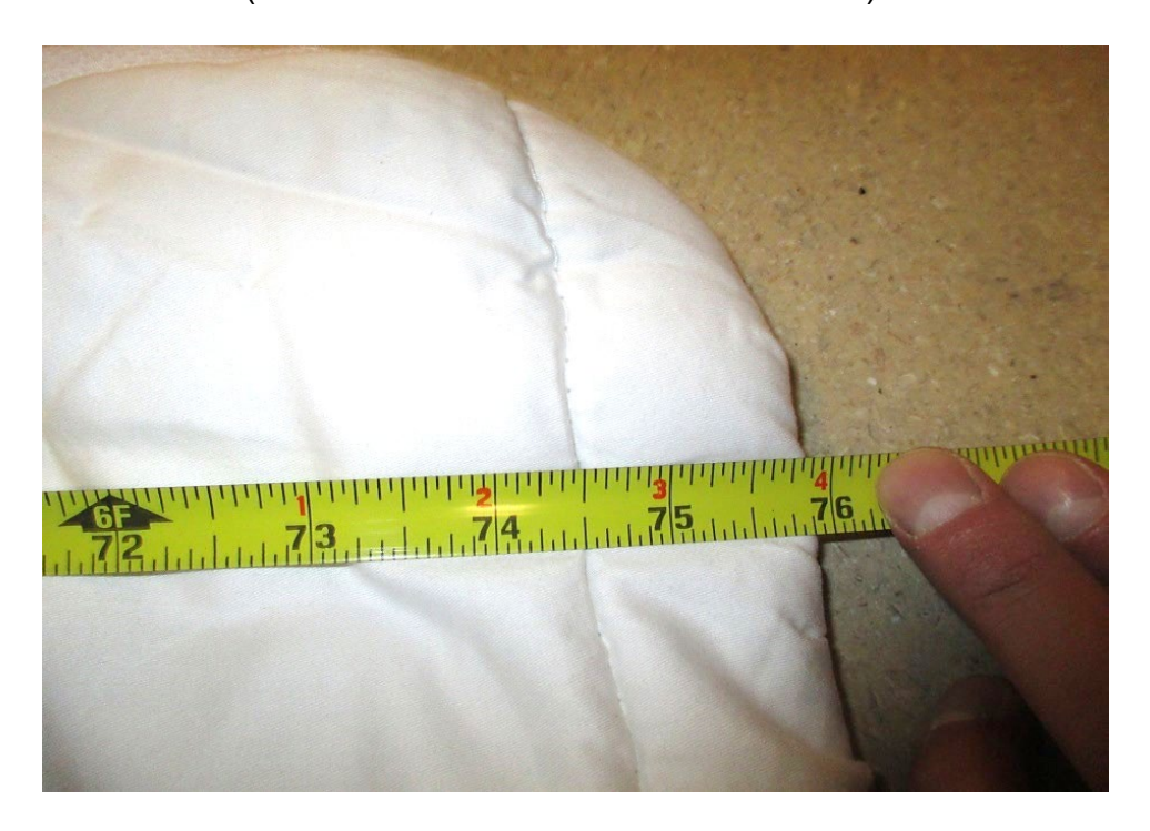
Figure 7: Mattress Pad (INCORRECT – DO NOT measure at curvature)