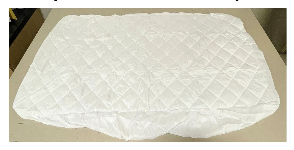
Figure 2: Mattress Pad with Elastic – Two Corners Cut